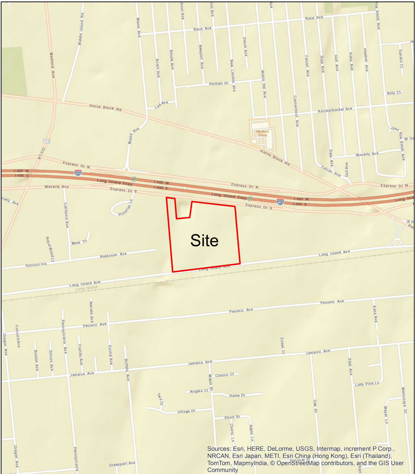
FIGURE 1-1 LOCATION MAP